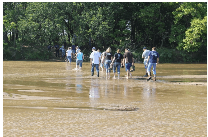
Crossing the river