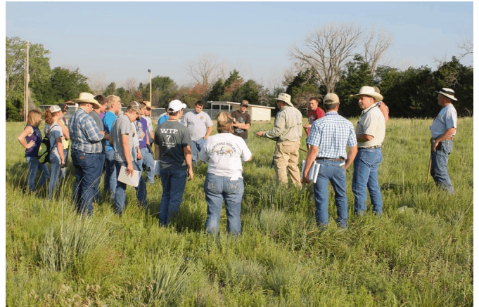
Learning about soils