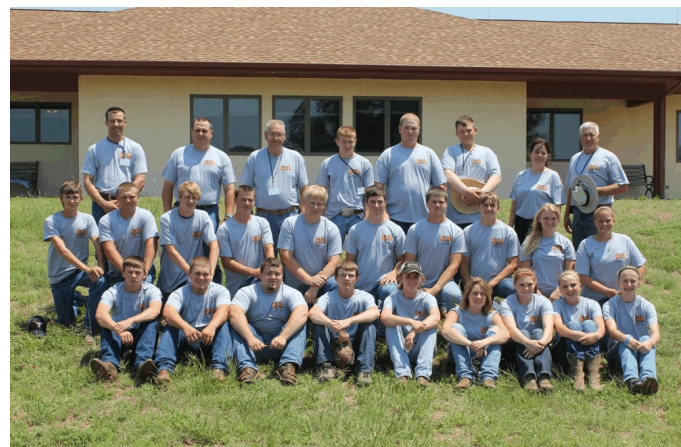
2012 Kansas Range Youth Camp

Submission deadline for the next issue of the Bluestem Bulletin: November 1, 2012